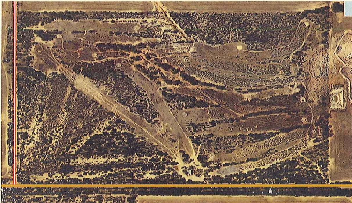
FIGURE 1 - AERIAL PHOTOGRAPH OF LOT 3771 (RESERVE 21547) CADOUX-KOORDA ROAD, KOORDA