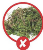
Green waste (Belongs in the waste bin)