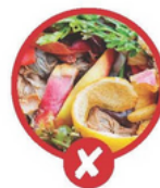
Food scraps (Belong in the waste bin)