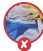
Soft (crunchable) Plastics (Belong in the waste bin)