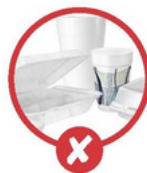
Polystyrene (Belongs in the waste bin)