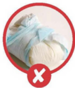
Nappies (Belong in the waste bin)