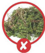
Green waste (Belongs in the waste bin)