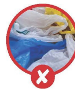
Soft (scrunchable) Plastics (Belongs in the waste bin)