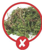
Green waste (Belongs in the waste bin)