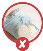
Nappies (Belongs in the waste bin)