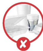
Polystyrene (Belongs in the waste bin)