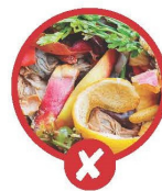
Food scraps (Belongs in the waste bin)