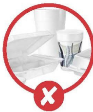
Polystyrene (Belongs in the waste bin)