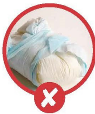
Nappies (Belongs in the waste bin)