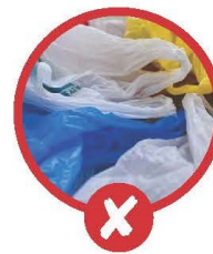
Soft (scrunchable) Plastics (Belongs in the waste bin)