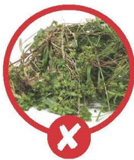
Green waste (Belongs in the waste bin)