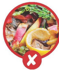
Food scraps (Belongs in the waste bin)