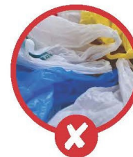
Soft (scrunchable) Plastics (Belongs in the waste bin)