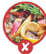
Food scraps (Belongs in the waste bin)