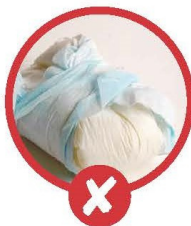
Nappies (Belongs in the waste bin)